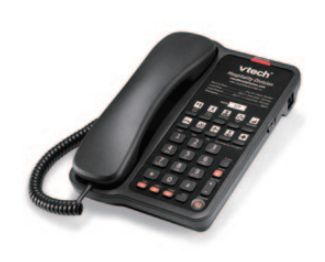
A1210 | A1220 CL-A1110