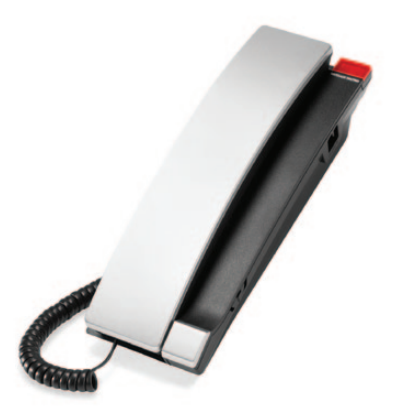
TrimStyle A2310 | A2321