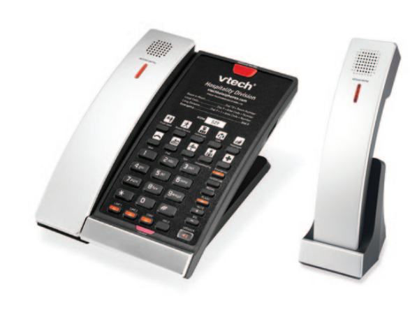
Cordless A2410 | A2420

A2410 | A2420 CTM-A2411 | CTM-A2421 CTM-A2411-BATT | CTM-A2421-BATT CTM-A2510