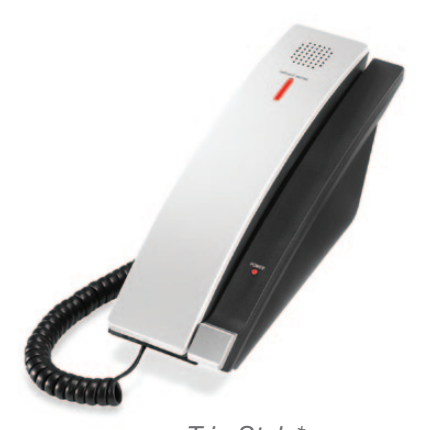
TrimStyle * S2310 | S2320