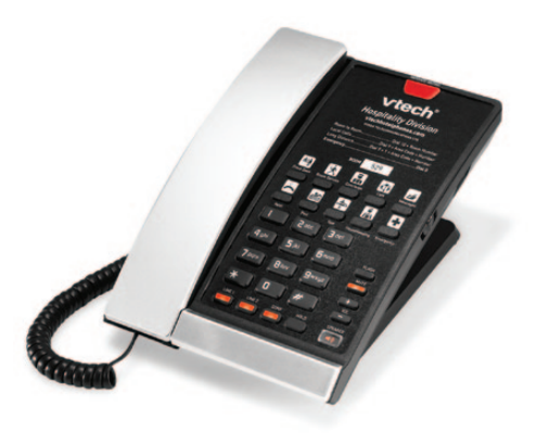
Corded Speakerphone $2210 | $2220