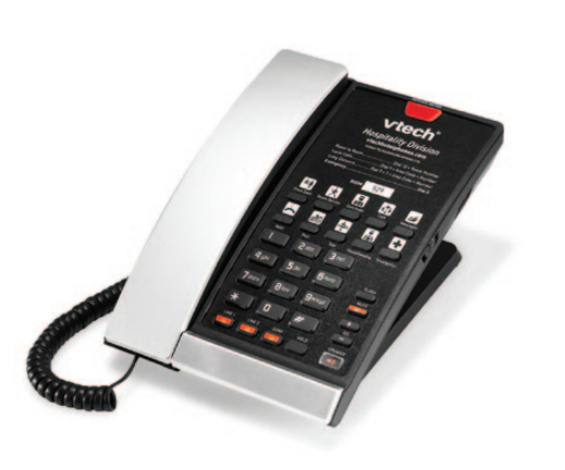
Corded Speakerphone A2210 | A2220

Affordable and reliable, our analog phones offer straightforward features that will make your guests feel right at home. Choose from contemporary styles to complement today's interiors or classic designs that make a more traditional impression.