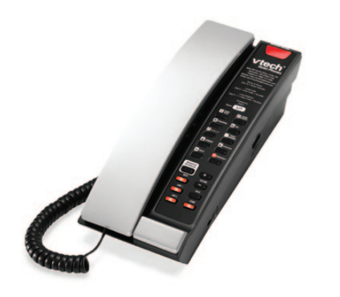
Petite Phone® (Non-Speakerphone) A2211 | A2221 CTM-A241P | CTM-A242P