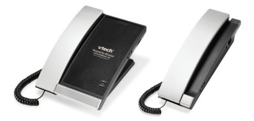
Lobby A2100 | A2310-NM